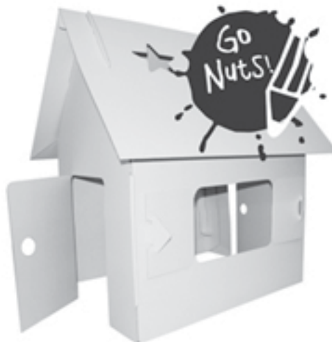
Puggy® is ready to decorate!