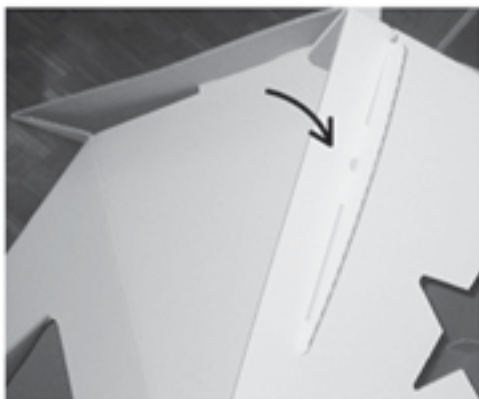
Step 6 Apply gentle pressure to push the remaining roof locks in place