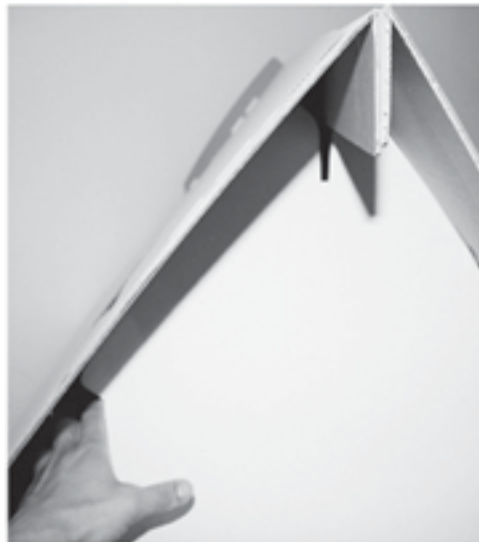
Step 5 – Raise the A frame. Ensure the roof tabs don't pop open.