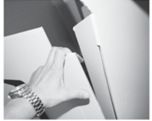
Step 3 Fold the top tab and insert into slit as shown above