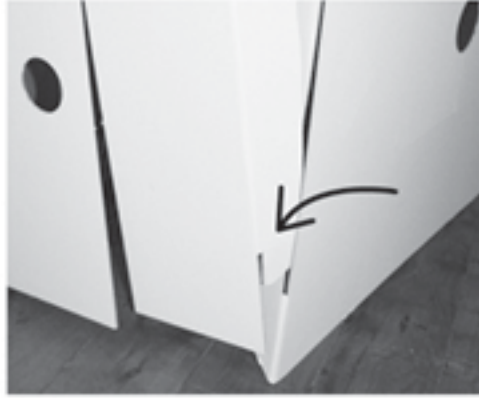
Step 2 Insert bottom tab first