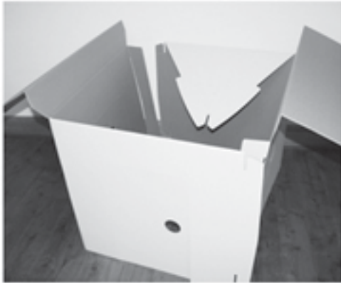
Step 1 Assemble the 2 sides like this

Before commencing Step 1, fold the creases in the roof.